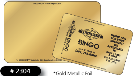
# 2304 *Gold Metallic Foil