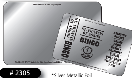
# 2305 *Silver Metallic Foil